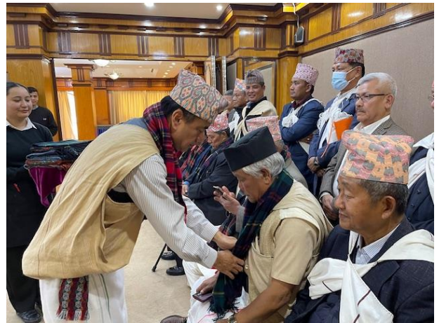
Tamu Forum-UK 2nd Hybrid Editorial Board Summit Photonews on Sat, 16 Dec 2023 at Kathmandu